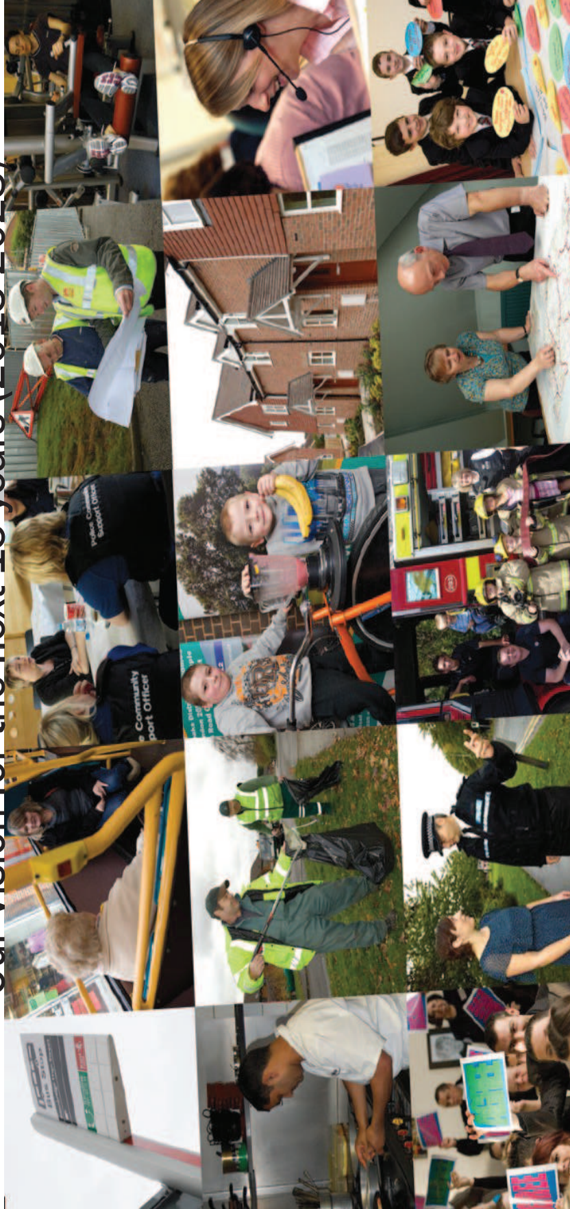
Public Consultation Draft